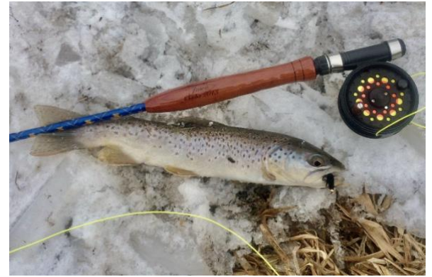
First Trout on a fly, Jan 3, 2015

The opening of the winter angling opportunities to all designated trout streams coincided with my freshman year at Winona State University, and the beginning of my fly fishing journey. I caught my first trout with a fly rod on January 3rd, 2015 in Rush Creek, and that first winter I fished close to 2 dozen different streams during the winter season. I fell in love with the challenge, solitude, and beauty of winter trout fishing, and that has carried on for the last decade.