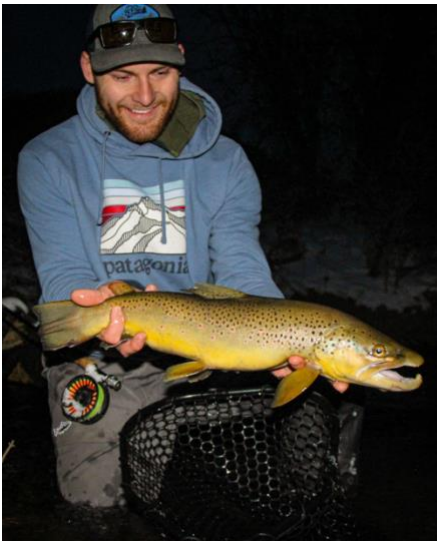
Jan 4, 2022